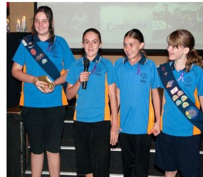
Candle Light 2011 - International Womens Day. More photos on Facebook - THANK YOU MONTROSE PHOTOS

“Ask yourself what you want people to do for you, then, grab the initiative and do it for them.”